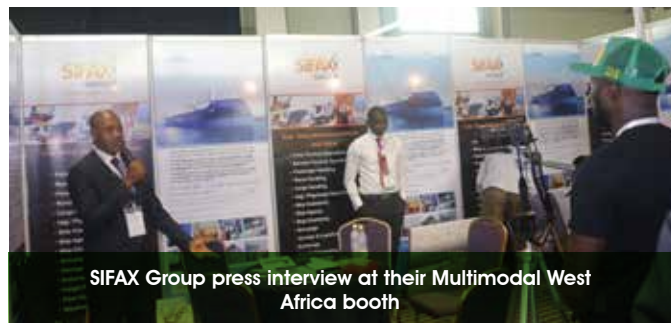
SIFAX Group press interview at their Multimodal West Africa booth