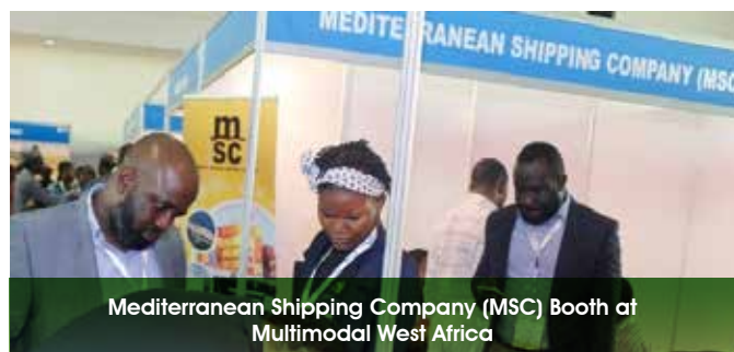
Mediterranean Shipping Company (MSC) Booth at Multimodal West Africa