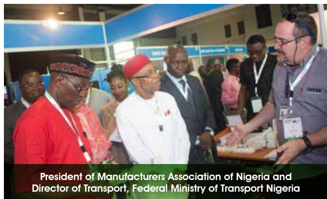
President of Manufacturers Association of Nigeria and Director of Transport, Federal Ministry of Transport Nigeria