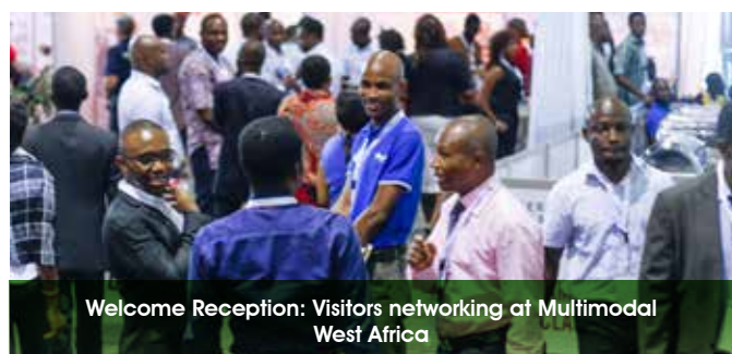
Welcome Reception: Visitors networking at Multimodal West Africa

For a list of invited and participating exhibitors and cargo owners, email us: multimodalafrica@clarionevents.com