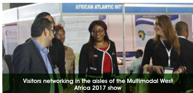
Visitors networking in the aisles of the Multimodal West Africa 2017 show